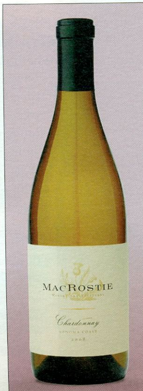
MACROSTIE Chardonnay Sonoma Coast 2008 (92, $25) SMART BUY

Citrus, green apple, spice, flowers, mineral; rich, elegant